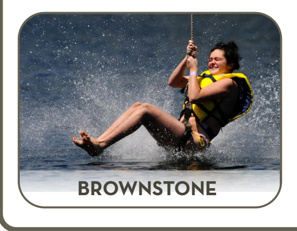
Bridge G August 1 & 2