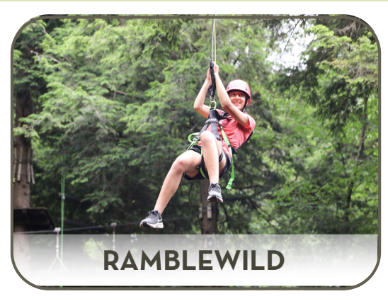
Bridge E July 18 & 19