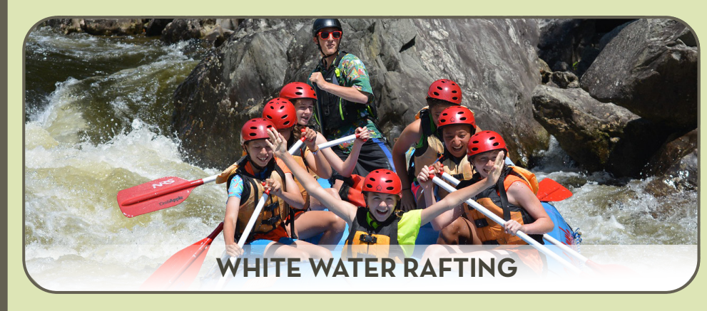
Bridge D July 11 & 12