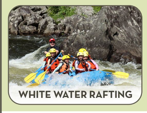
Bridge F July 25 & 26