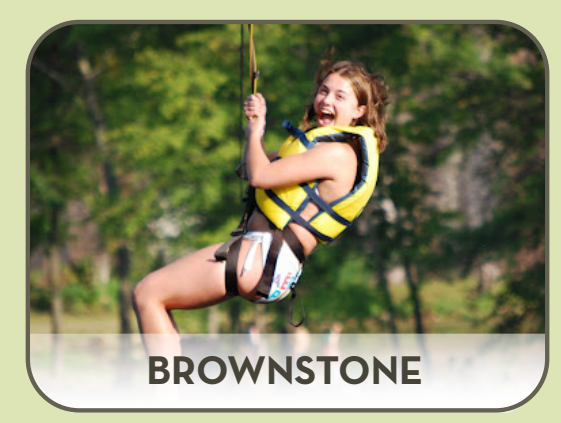
Bridge B June 27 & 28