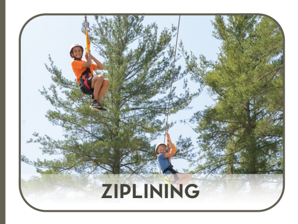
Bridge C July 4 & 5