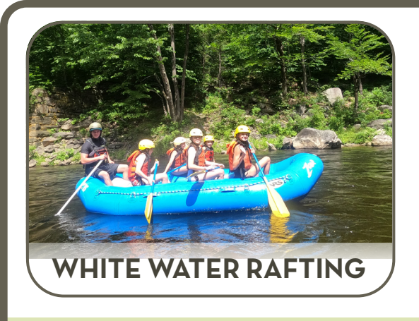
Bridge A June 20 & 21