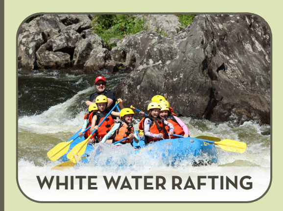
Bridge F July 25 & 26