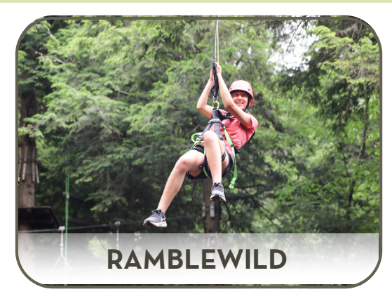
Bridge E July 18 & 19