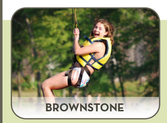
Bridge B June 27 & 28