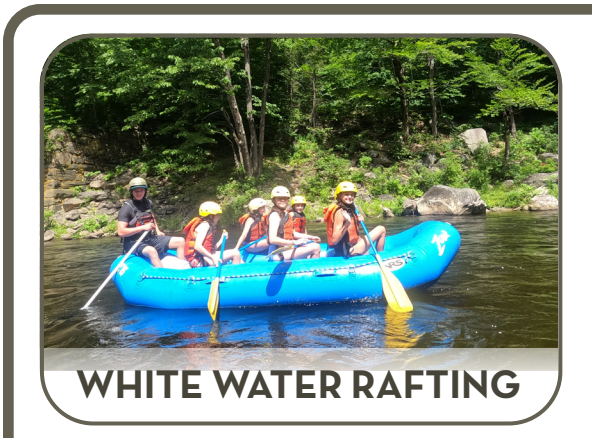
Bridge A June 20 & 21