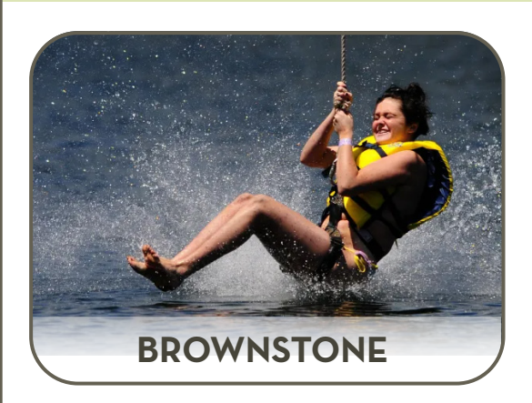
Bridge G August 1 & 2