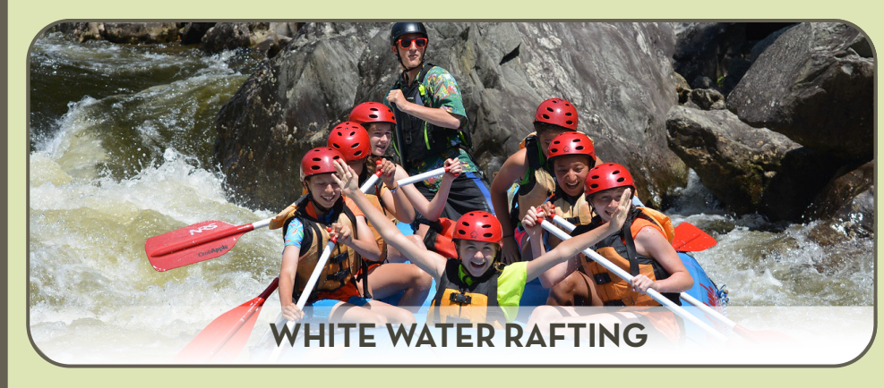
Bridge D July 11 & 12