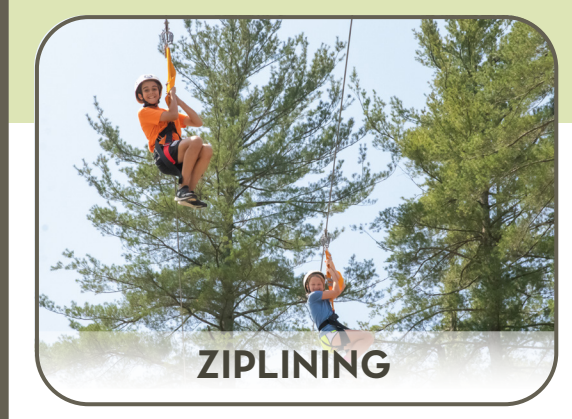
Bridge C July 4 & 5